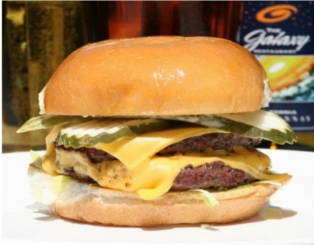
THE GALAXY BURGER

THE GALAXY BURGER* 14 TWO QUARTER POUND PATTIES, AMERICAN CHEESE, SECRET SAUCE, LETTUCE, PICKLES, KAISER BUN.